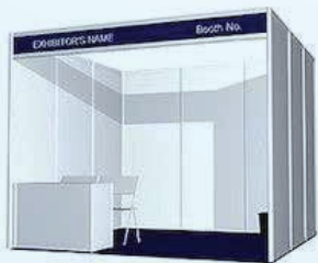
Shell Type (2.5m x 2.5m)